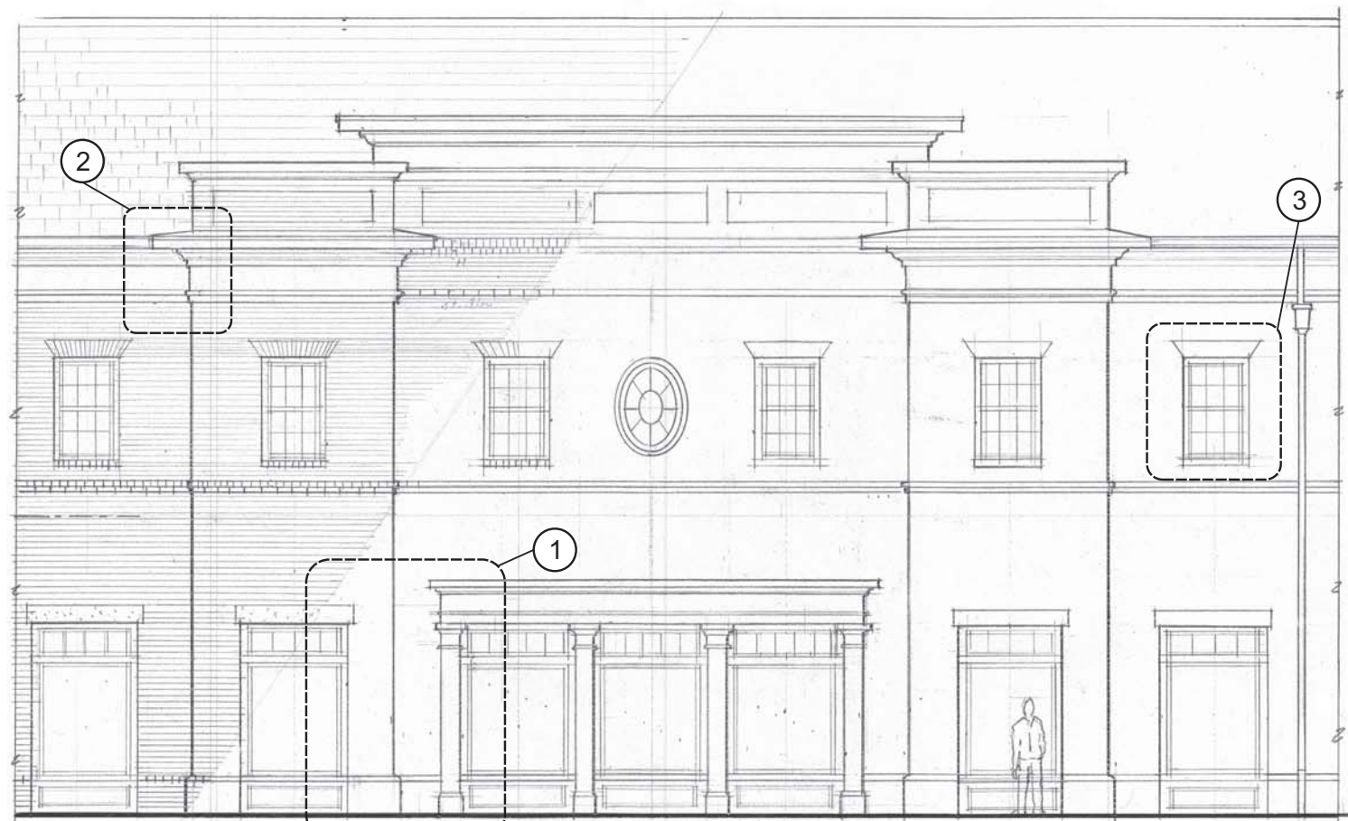
partial east elevation 1/4" = 1'-0"