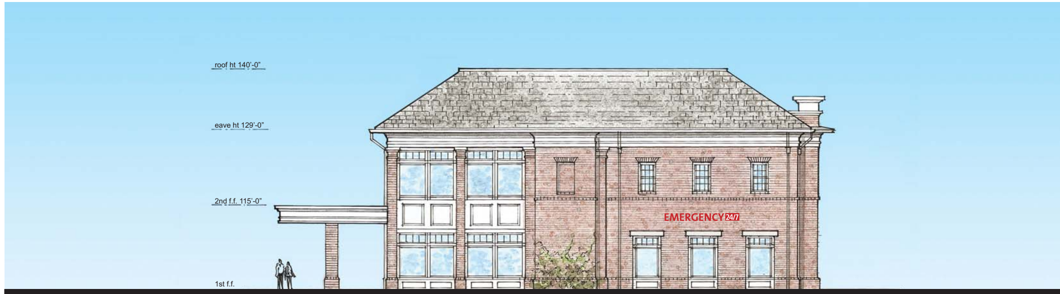
south elevation 1/8" = 1'-0"