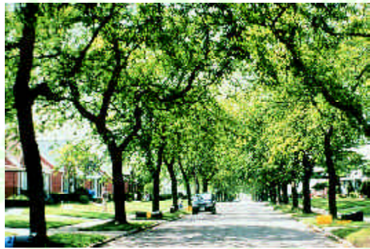
Photos illustrate the growth and effect of street trees over a 30-year span.

T rees are among the most important environmental assets in our community and provide a canopy for the urban landscape. Cooling shade, noise absorption, wildlife shelter and food, oxygen production, glare reduction and decreased storm water runoff are just a few of the advantages of trees and other landscape plants. Most important is the beauty and uniqueness that trees provide in our neighborhoods. With proper selection, trees provide a unifying design element which makes a neighborhood more inviting and which enhances property values.